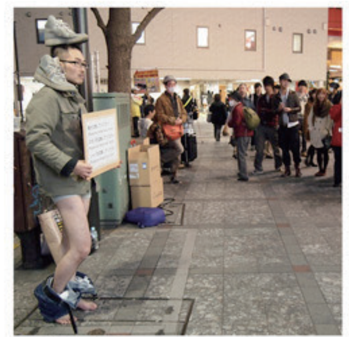
頭の上に靴を置く Put shoes on the head 2012 signboard, performer, passersby "Please exchange your shoes/ pants/ shirt"