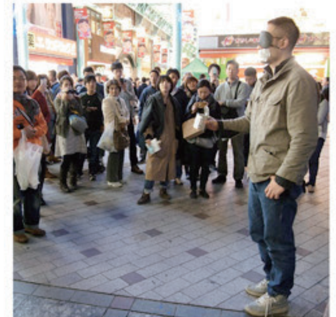
宇宙の缶詰秘めたる音に:パイナップル Canned Universe With Hidden Noise: Pineapple 2012 can of pineapple, money, performer, passersby