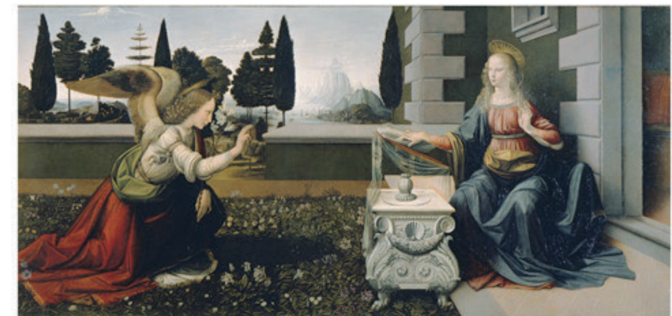
受胎告知 Annunciation 1477 oil and tempera on poplar 98 x 217 cm