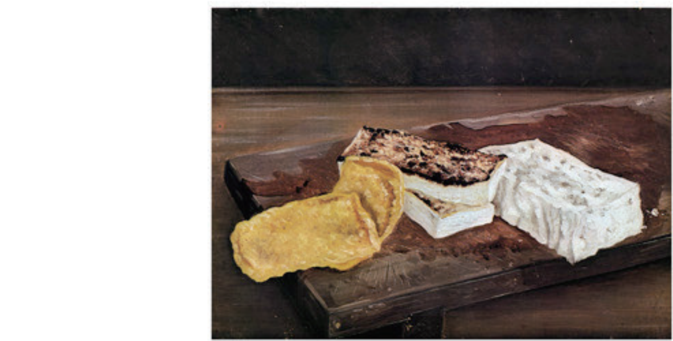
豆腐 bean curd 1877 oil on canvas 32.5 x 45.3 cm